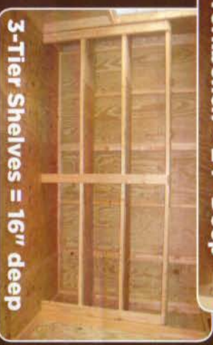
3-Tier Shelves = 16" deep

We don't just show a 5 year warranty... We stand behind it!