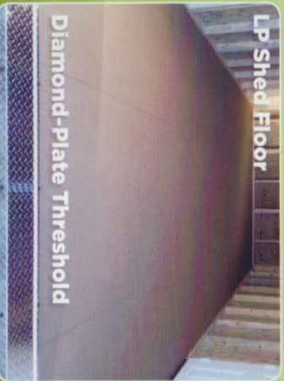
LP Shed Floor